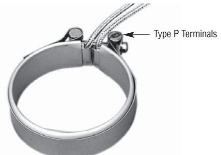
Figure 2 — Two-Piece Construction