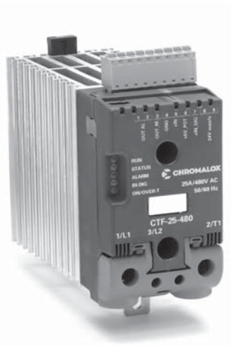
CTF 25 A - 120 A