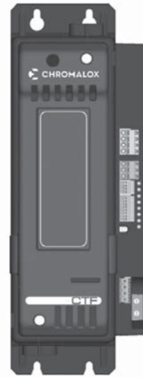
CTF 150 A - 250 A