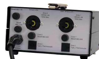
Typical Rear View